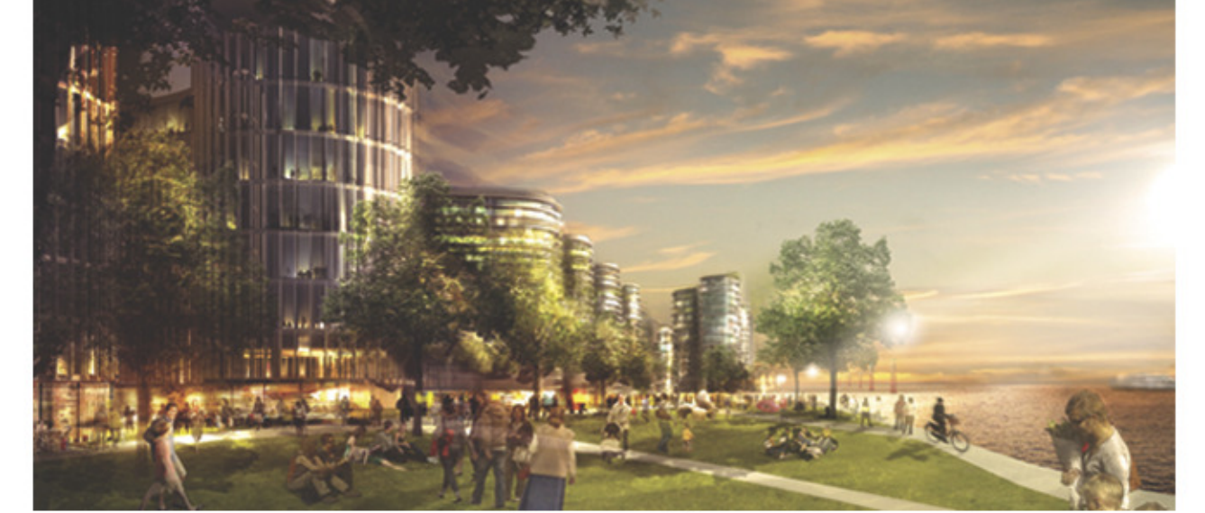
WING KFT, DUNAPASSAGE